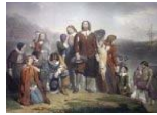
To be a Pilgrim.

1 Fire in Plymouth destroys several buildings. (1623)