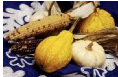
Fruits of the harvest

That spells THANKS for joy in living and a jolly good Thanksgiving-- Aileen Fisher, All in a Word