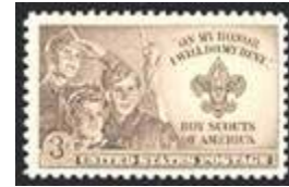
We support the Scouts.

It's not just a motto. We are not the Boy Scouts, but we work hard at being prepared.