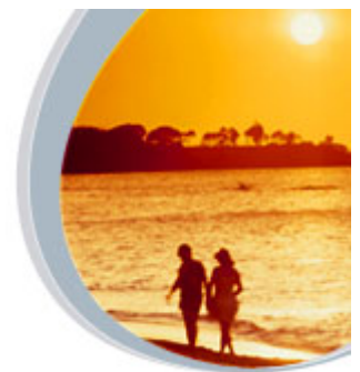
How hot was it?

Whalen Restoration Services--one call and help will be